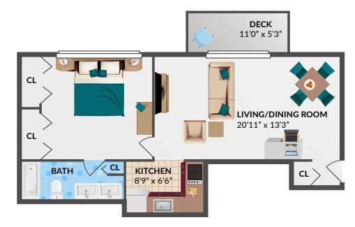
1 BEDROOM / 1 BATHROOM 730 sq. ft.