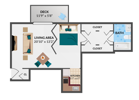
STUDIO 562 sq. ft.