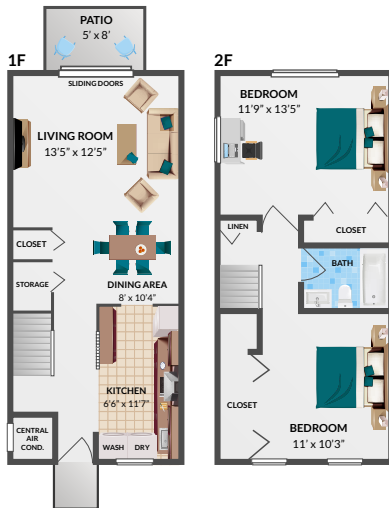
2 BEDROOM / 1 BATHROOM TOWNHOME 900 sq. ft.