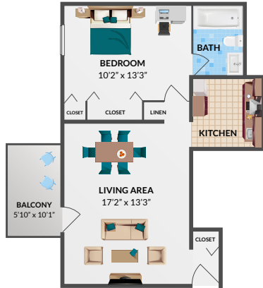
1 BEDROOM / 1 BATHROOM APARTMENT 750 sq. ft.